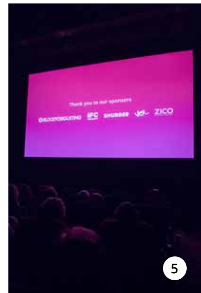
1. Marquee & Gobo Placement 2. Step & Repeat 3. Branded Signage 4. Parties & Receptions 5. Theater Logo Recognition