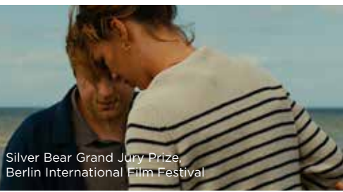
Silver Bear Grand Jury Prize, Berlin International Film Festival

"The best British horror film ever made." - Empire