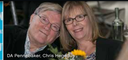
DA Pennebaker, Chris Hegedus