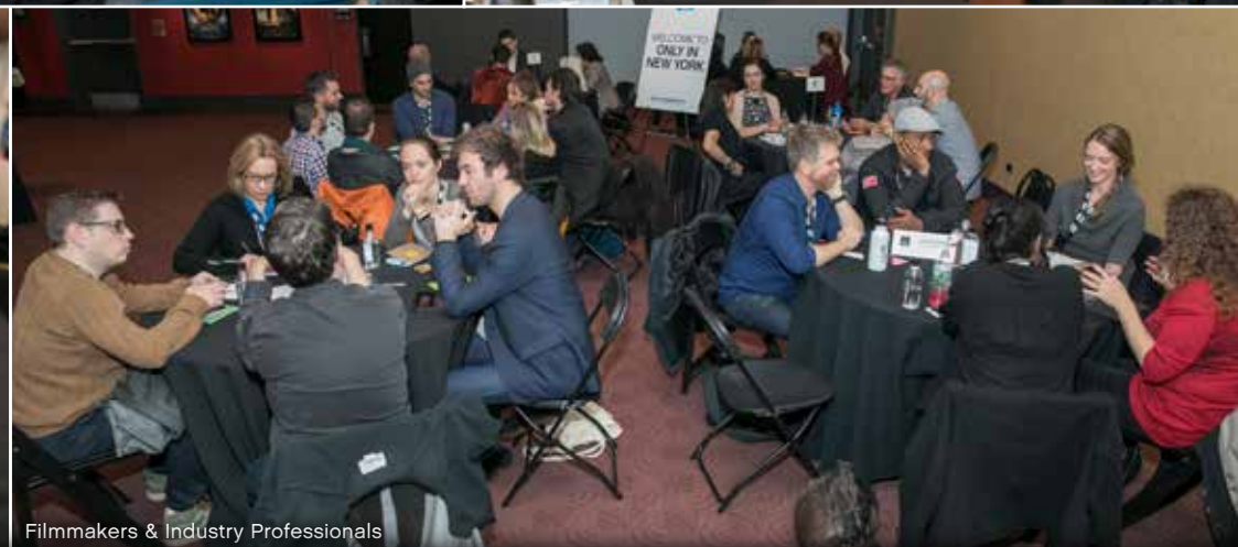
Filmmakers & Industry Professionals

Only In NY features four days of networking sessions with Filmmakers and industry professionals from companies including; HBO Documentary Films, Amazon Studios, Discovery, Submarine, Cinetic, RadicalMedia and many others.