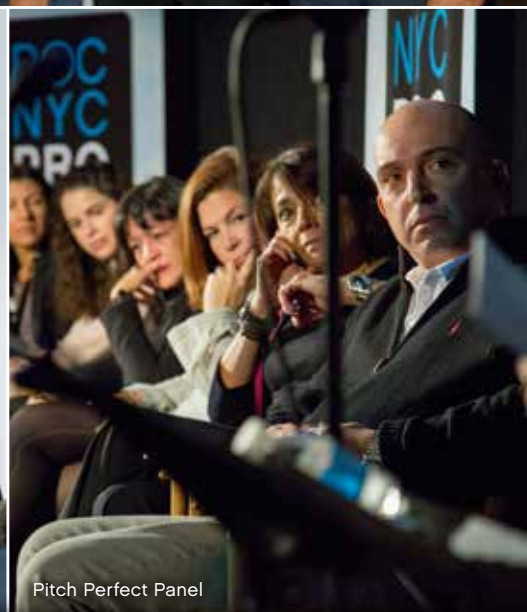
Pitch Perfect Panel