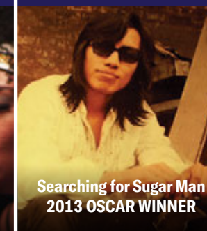
Searching for Sugar Man 2013 OSCAR WINNER