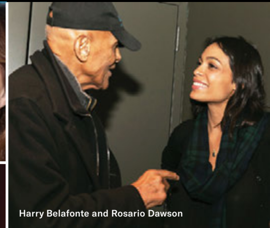
Harry Belafonte and Rosario Dawson