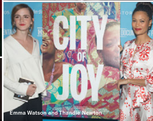
Emma Watson and Thandie Newton