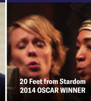
20 Feet from Stardom 2014 OSCAR WINNER