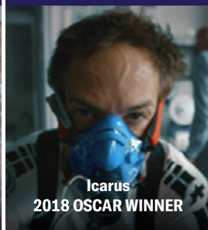
Icarus 2018 OSCAR WINNER