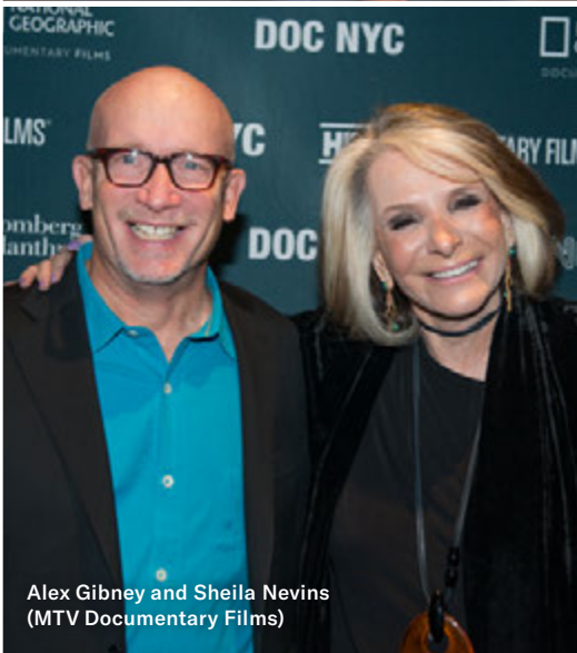
Alex Gibney and Sheila Nevins (MTV Documentary Films)