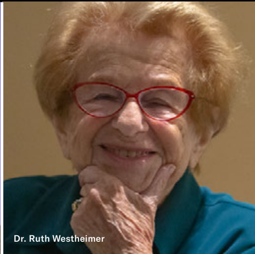
Dr. Ruth Westheimer