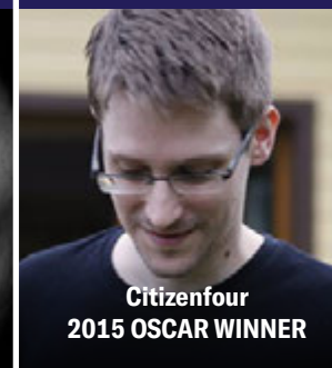
Citizenfour 2015 OSCAR WINNER