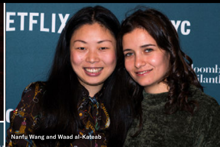
Nanfu Wang and Waad al-Kateab