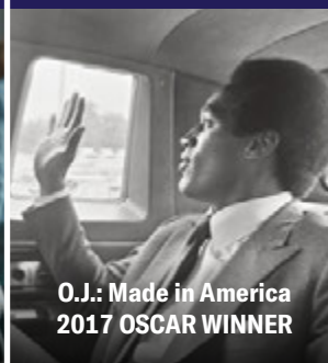
O.J.: Made in America 2017 OSCAR WINNER