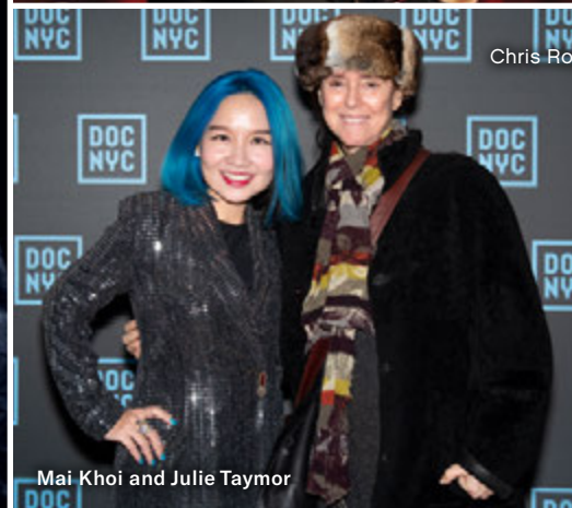
Mai Khoi and Julie Taymor