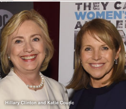
Hillary Clinton and Katie Couric