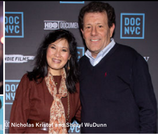
Nicholas Kristof and Sheryl WuDunn