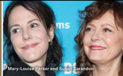
Mary-Louise Parker and Susan Sarandon