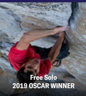
Free Solo 2019 OSCAR WINNER

5 Broken Cameras How to Survive a Plague